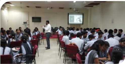
Live Interaction with Students