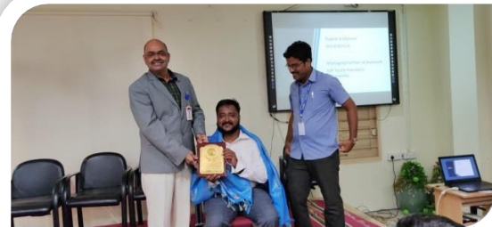
Felicitation to YOUNG CEO